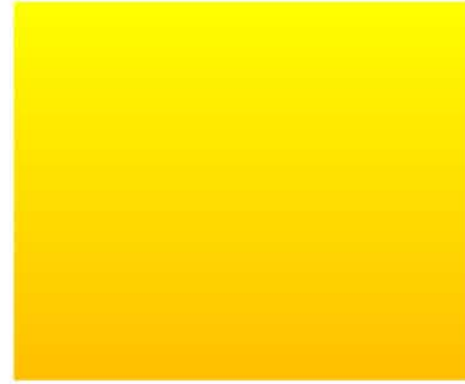
Deyodoge:hö' (It's square)